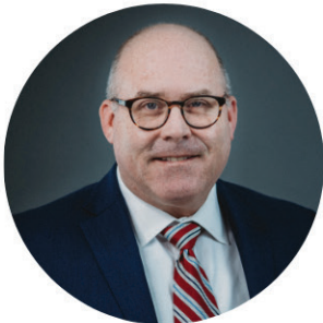
MAYOR JOHN CORBITT