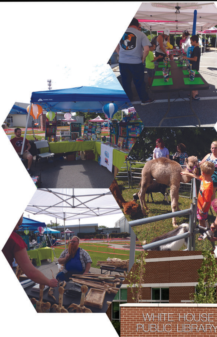
WHITE HOUSE PUBLIC LIBRARY

The White House Library Fandom Fair is a one-day street fair full of all things fantasy, sci-fi, comics, gaming, anime, and more. Our theme is Fantasy: Imagine Your Story. We will have activities for all ages such as escape rooms, crafts, petting zoo, caricature artist, balloon twister, vendors, a costume contest, Lego building contest, and more. To register as a vendor for the event, please visit our website at www.youseemore.com/whl .