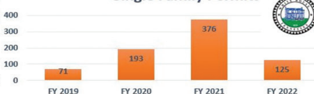
Single Family Permits

“Open, honest communication is the best foundation for any relationship, but remember that at the end of the day it's not what you say or what you do, but how you make people feel that matters the most.”