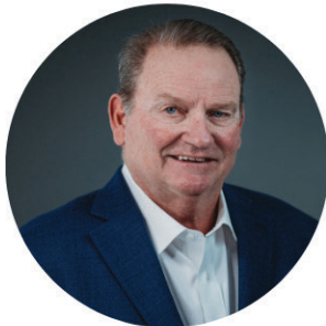
ALDERMAN CLIF HUTSON WARD 4